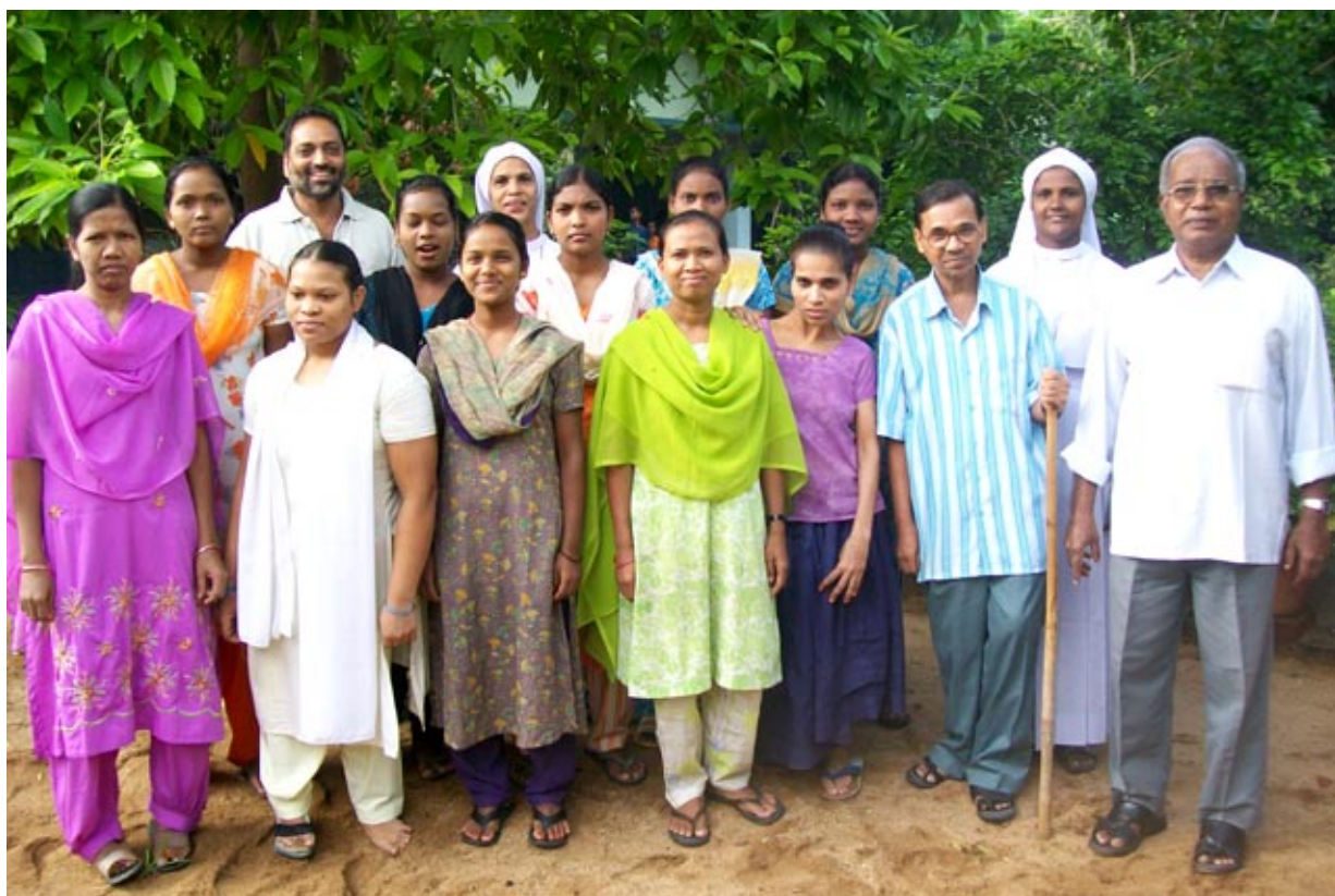
Staff of Vikas Deepti