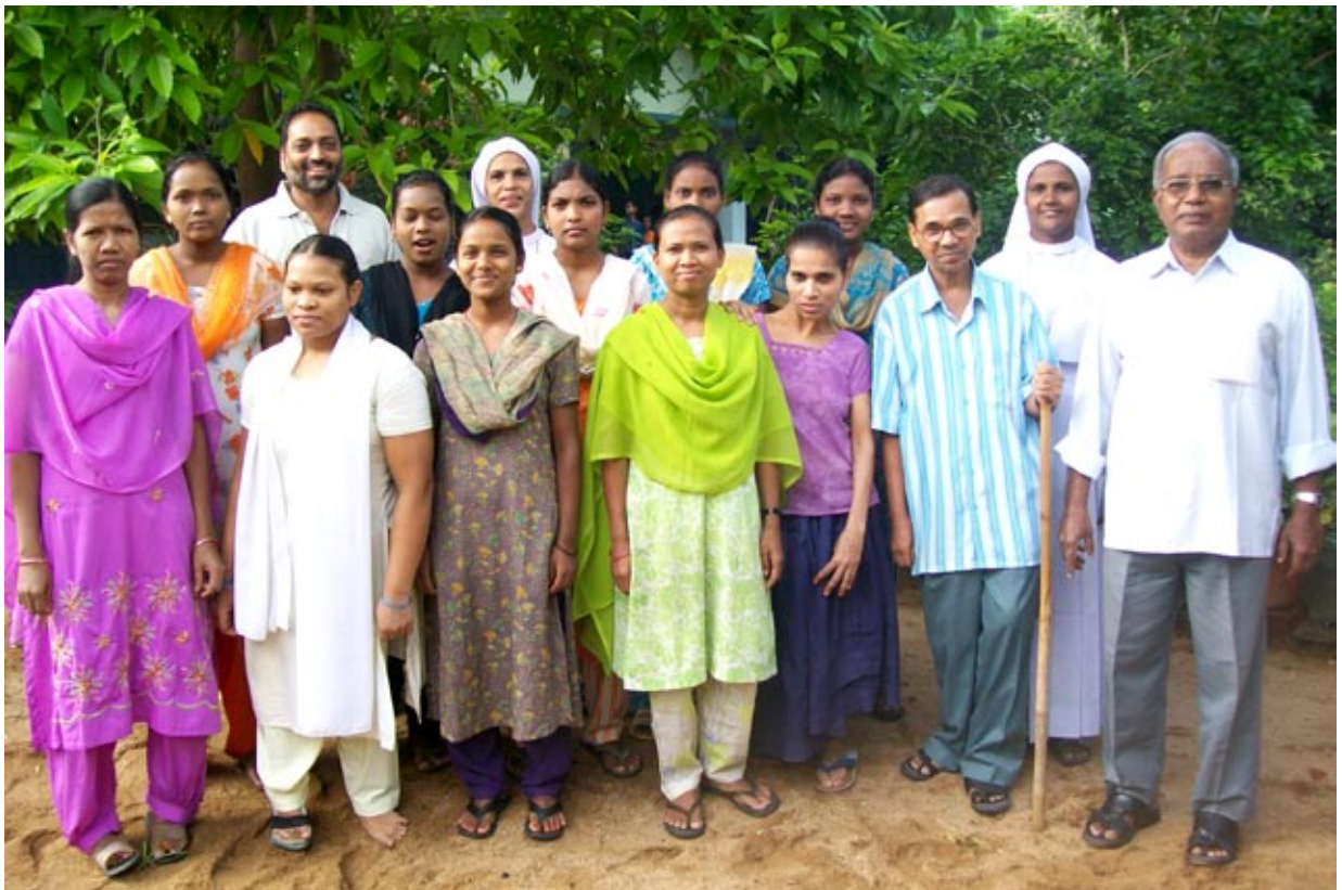
Staff of Vikas Deepti