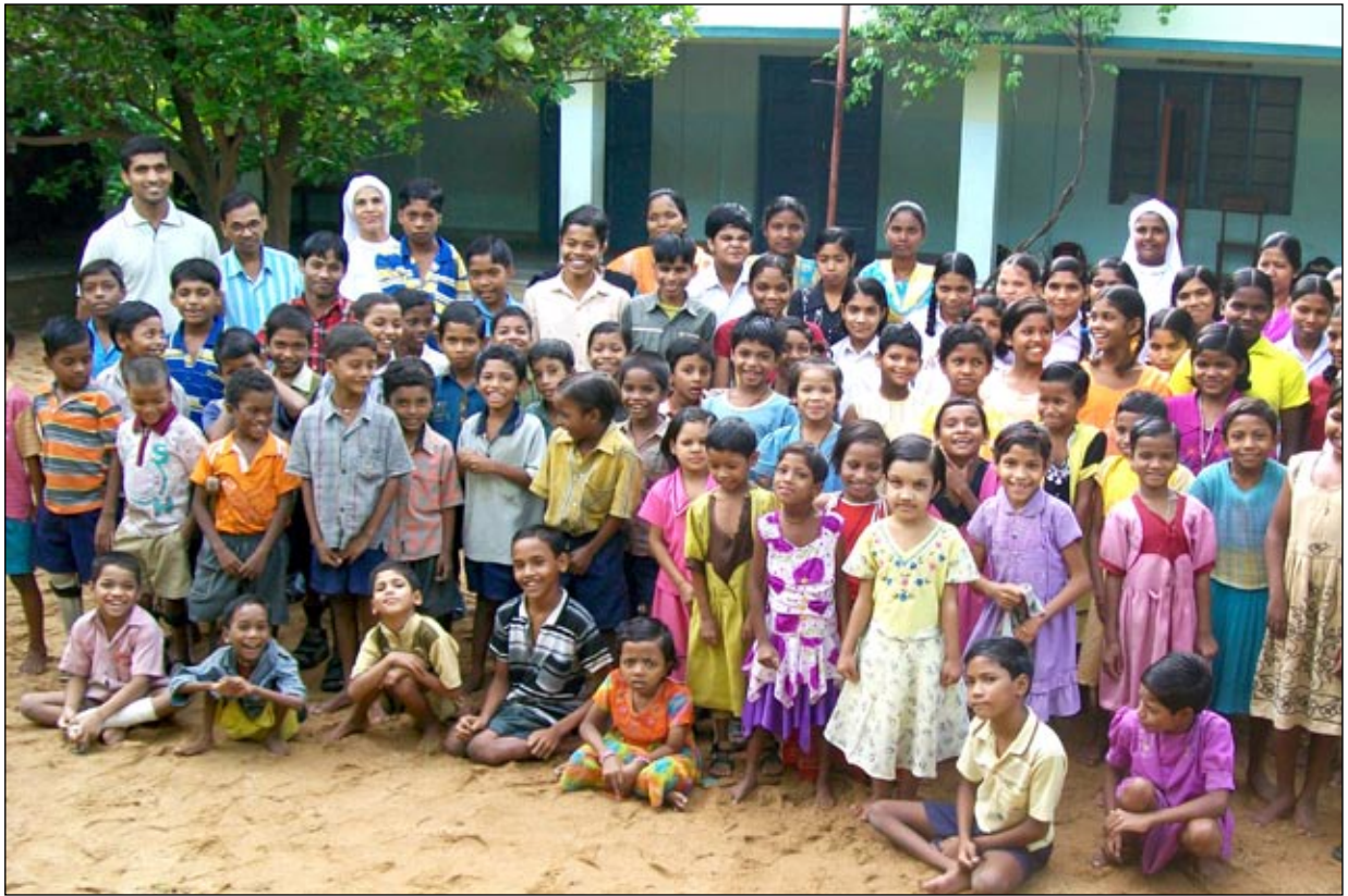
Staff and Children of Vikas Deepti