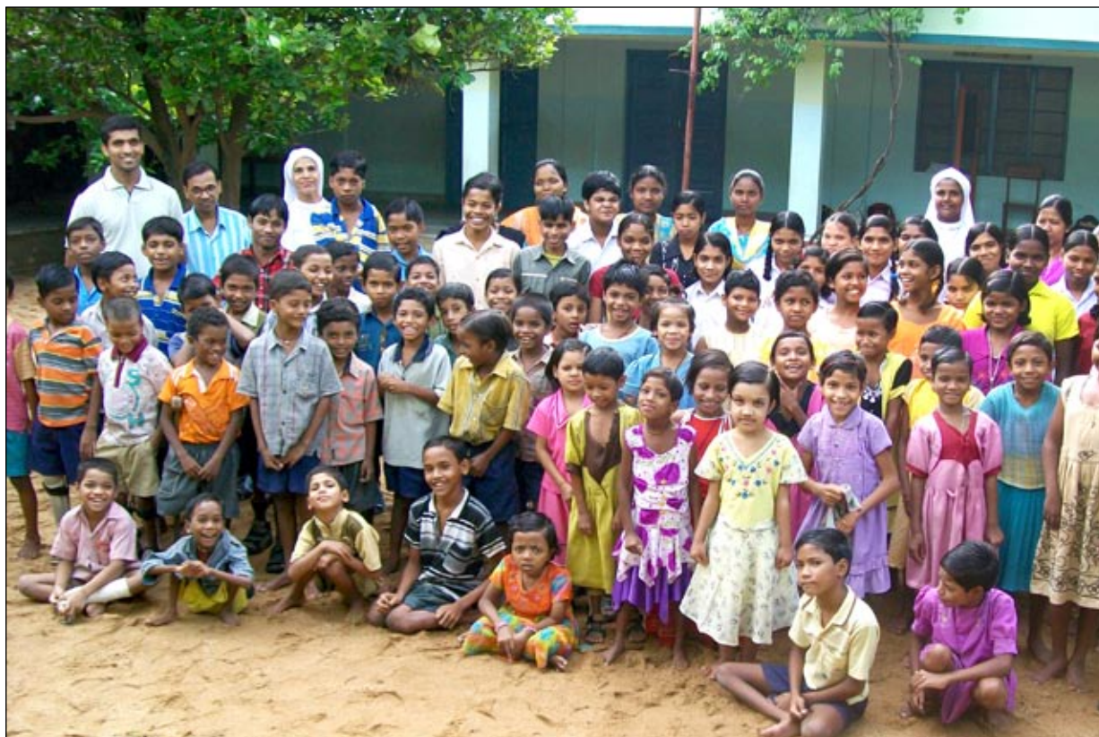
Staff and Children of Vikas Deepti