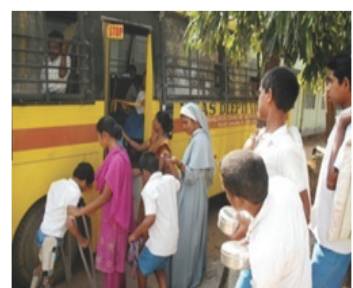
Set out to school