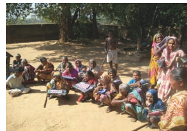
Leprosy - Health