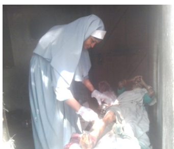
Care for Lepers